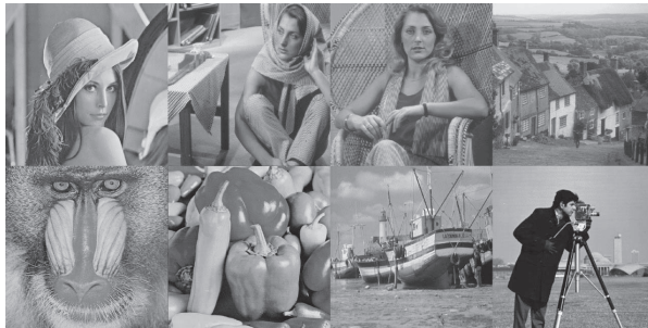
Fig. 2. The 512 \times 512 grayscale still images used in the experiments. Top row (left to right): Lenna, Barbara, Barbara2, Goldhill; Bottom row (left to right): Mandrill, Peppers, Boat, Cameraman.