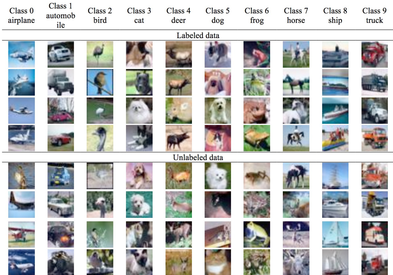
Figure 4. Some labeled and unlabeled images of CIFAR-10 after Stage 1.